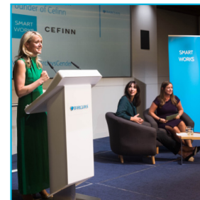
Run an event