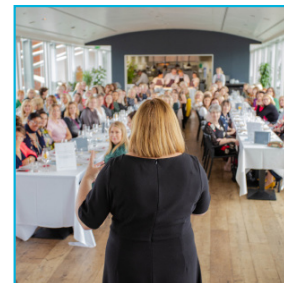
Have us speak at your event