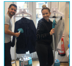
Book a Corporate Volunteer Day