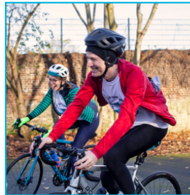
Cycle for Smart Works