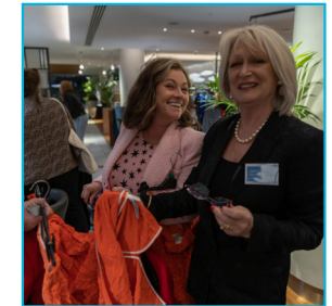
Attend one of our Fashion Sales